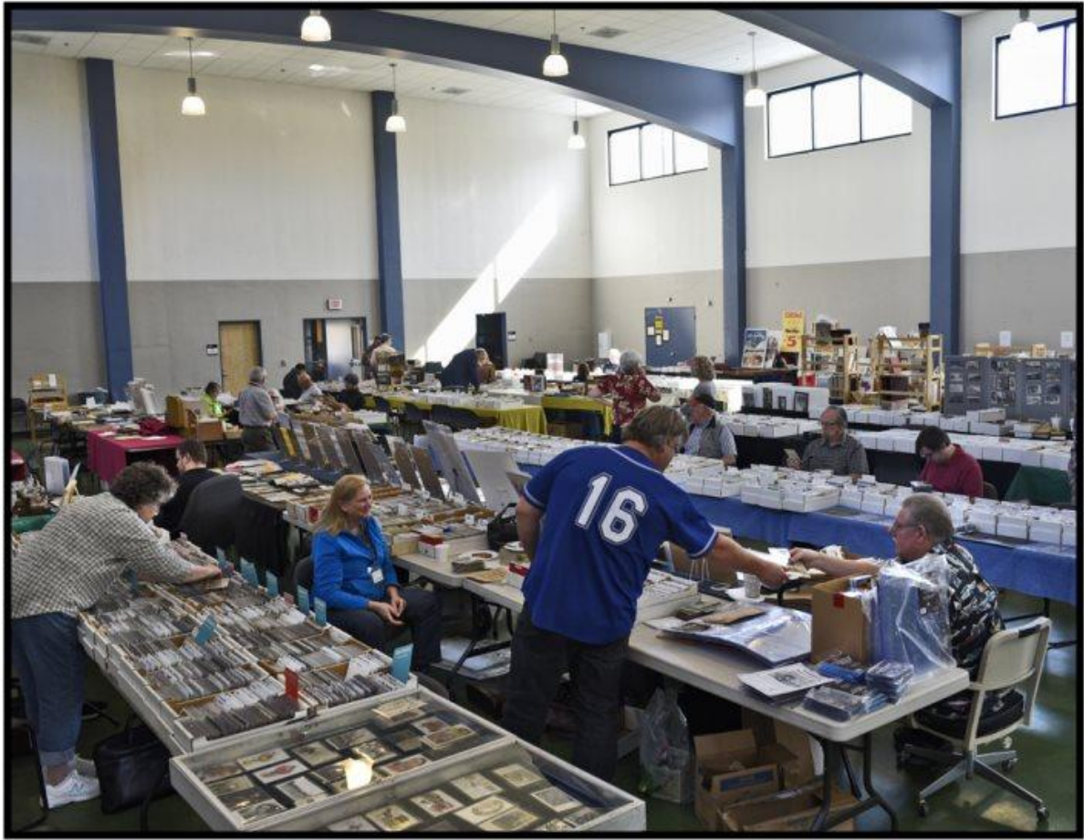
Thanks to all who helped make our 36th Annual Show and Sale a big success.